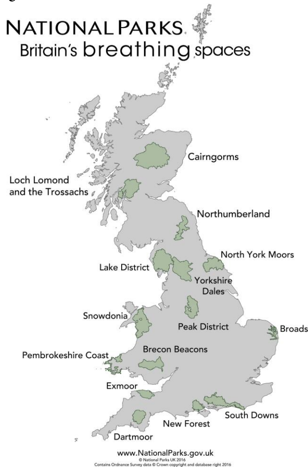
Figure 2: Location of UK National Parks